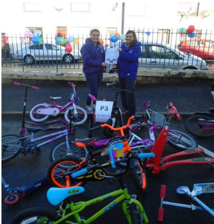
Car parking spaces gave way to cycle parking on 13th March