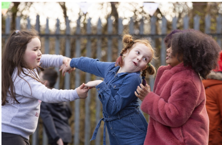
Pupils at Elmgrove Primary enjoying Feet First Families day