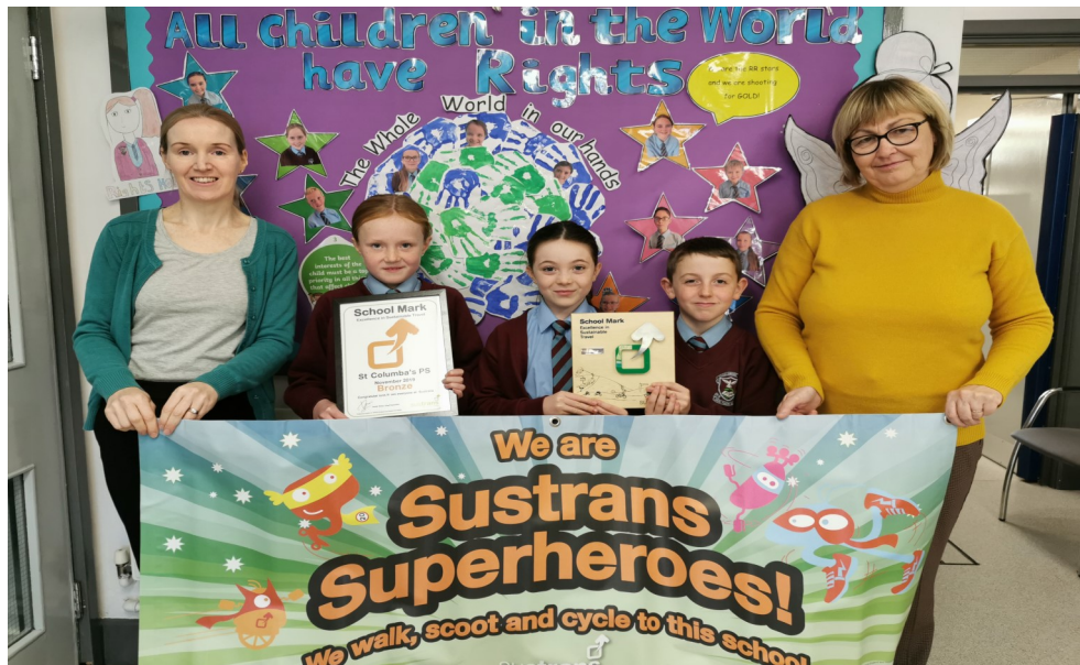
St Columba's PS, Kilrea celebrate scooping the School Mark Bronze Award

We are currently working with over 400 schools across Northern Ireland. Please visit our website where you can learn more about the programme and download newsletters from other areas.