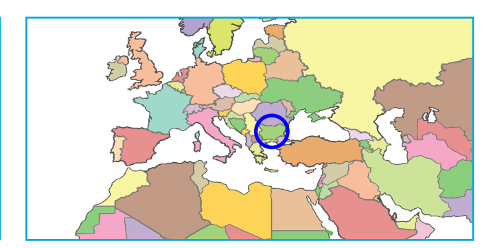
Part F: Statistics What news do these numbers tell us this week?

Where in the world is rubbish, including plastic bottles, building up on the Iskar River?